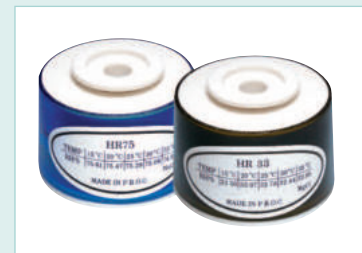
RH300-CAL Optional calibration salt bottles