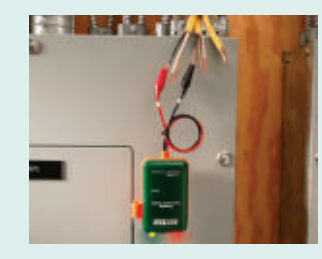
Use for local continuity or for remote wiring identification.

Continuity Tester includes Remote probe with bi-color LED for wire identification highlight