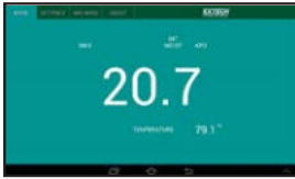
MOISTURE / TEMPERATURE