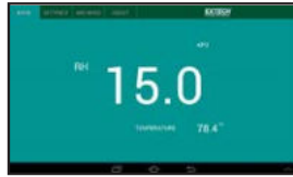
HUMIDITY / TEMPERATURE