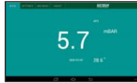
mBAR / TEMPERATURE