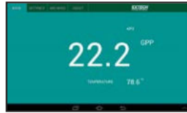
GPP / TEMPERATURE