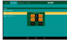
EASY TO NAVIGATE MENUS