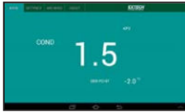
CONDENSATION / DEW POINT