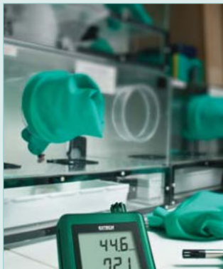
Monitor and record temperature and humidity values in the calibration rooms, office, clean rooms, and storage facilities