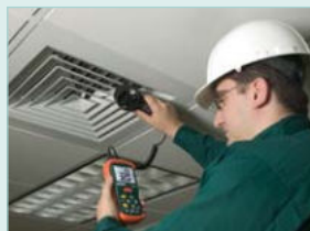
AN100 and AN200 used in HVAC applications measuring airflow from heating vents.