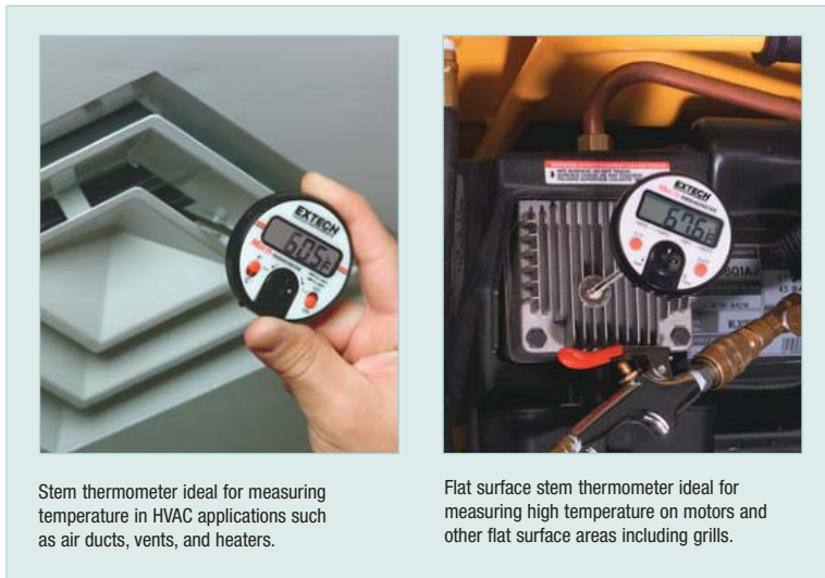
Stem thermometer ideal for measuring temperature in HVAC applications such as air ducts, vents, and heaters.