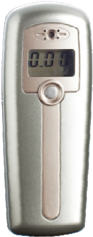
AL2500 No need to use Mouthpiece