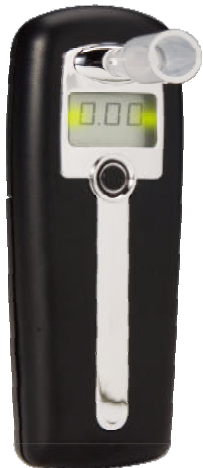
AL2500elite Use Mouthpiece