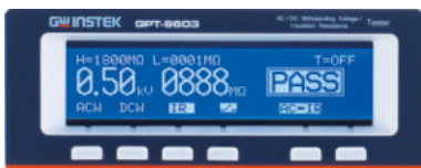
Large LCD, High Intensity Indicators and Function Keys

The 240 x 48 display clearly shows the applied voltage, test parameters, test conditions, measurement value and result on the screen at the same time. The real-time status update on the LCD display accompanied by the multi-colored LED status indicators on the front panel allow operators to have a full control of the test process to perform precession test and avoid unnecessary operation risks at the same time. The status indicator above the high voltage output terminal will automatically flash when an output is in place. In addition, the function keys arranged below the LCD display provide convenient operation that test functions can be easily changed by a single pressing.