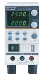
PFR-100M Front Panel