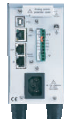
PFR-100M Rear Panel