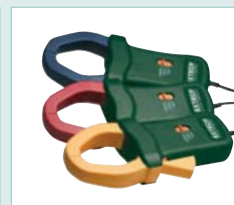
Model PQ3120 1000A Current Clamp Probes with 2.2" (55mm) jaw opening

1200A (12"/304mm) or 3000A (24"/609mm) Flexible Current Clamp Probes for wrapping around busbars