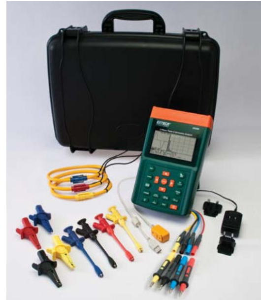
Includes (3) flexible current clamps, (4) voltage leads with alligator clips and retractable plunger clips, 8 AA batteries, universal AC adaptor, software, USB interface cable, and case