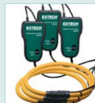
Model PQ3220 (3000A) Model PQ3210 (1200A)

Choose the best clamp probes to fit your application needs ranging from 100A to 3000A and flexible vs traditional jaw type.