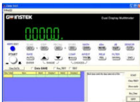
General Control Mode