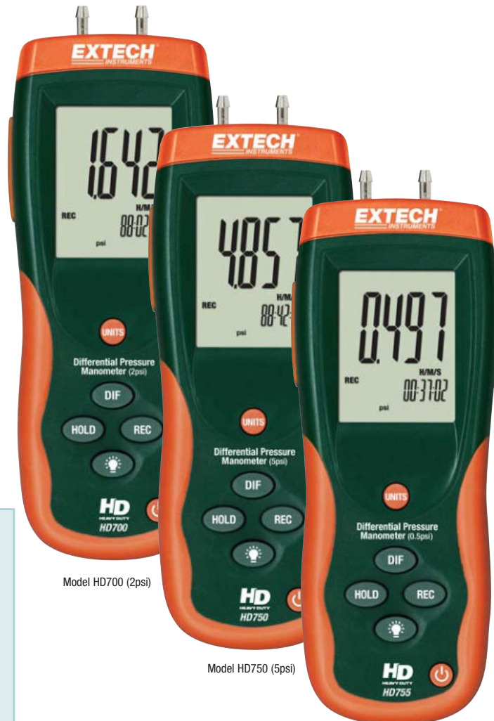
Model HD700 (2psi)