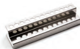
HI740216 Test Tube Cooling Rack

For safety, the optional HI740217 safety shield and HI740216 test tube cooling rack for the HI839800 are strongly recommended.