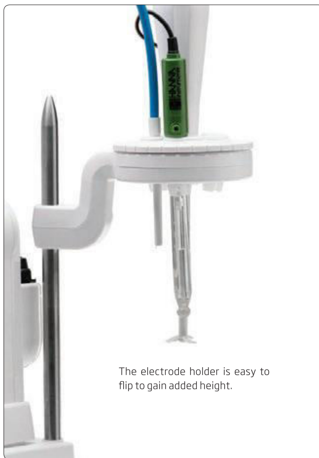
The electrode holder is easy to flip to gain added height.

The HI931 offers support for one analog board to allow an electrode, a stirrer, and up to two burettes to be connected to one unit simultaneously.