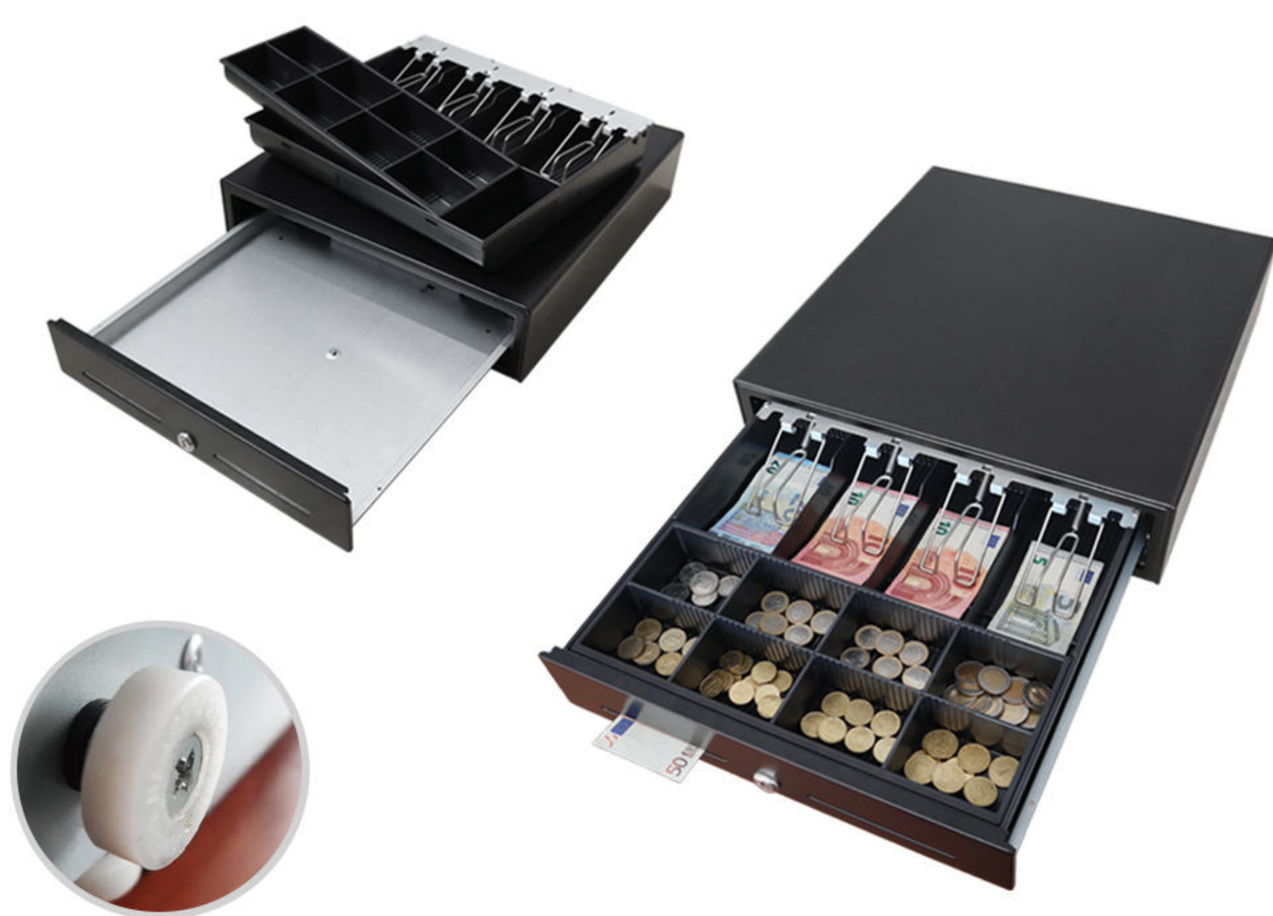
Durable Nylon Roller