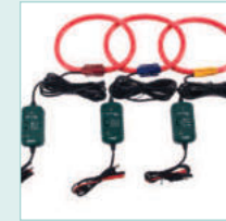
Model PQ34-30 3000A (24"/600mm) Flexible Current Clamp Probes for wrapping around busbars