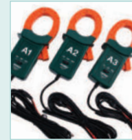
Model PQ34-12 1200A Current Clamp Probes with 2" (50mm) jaw size